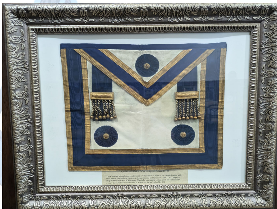
Canadian Master Mason Apron (circa 1910)