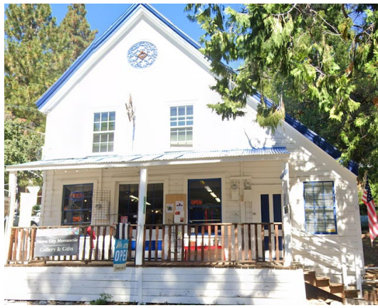
Harmony Lodge 164